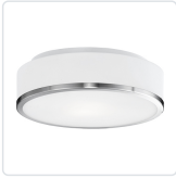
FM6012-BN Brushed Nickel